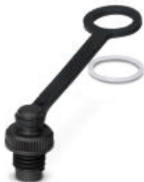
M8 sealing cap made of plastic with fixing band, for free M8 sockets, with 11.5 mm fastening eye

Please be informed that the data shown in this PDF Document is generated from our Online Catalog. Please find the complete data in the user's documentation. Our General Terms of Use for Downloads are valid ( http://phoenixcontact.com/download )