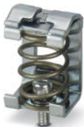
Shield connection terminal block, for applying the shield directly to the conductive mounting plates

Please be informed that the data shown in this PDF Document is generated from our Online Catalog. Please find the complete data in the user's documentation. Our General Terms of Use for Downloads are valid ( http://phoenixcontact.com/download )