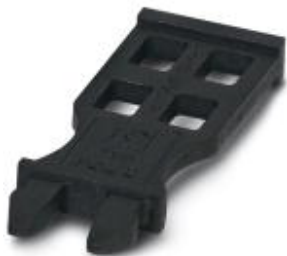
Strain relief, length: 28.9 mm, width: 9.6 mm, number of positions: 2, color: black

Please be informed that the data shown in this PDF Document is generated from our Online Catalog. Please find the complete data in the user's documentation. Our General Terms of Use for Downloads are valid ( http://phoenixcontact.com/download )